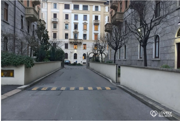
ANTA PIANO RIALZATO